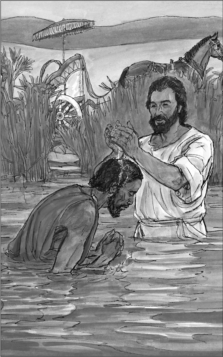
Philip baptizes a man from Ethiopia.