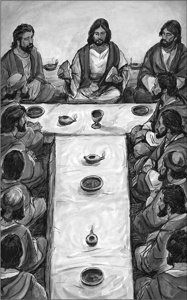
Jesus gives his friends the Lord's Supper.